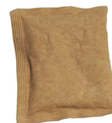
Kraft Desiccant Pouch