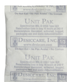
Tyvek® Desiccant Pouch