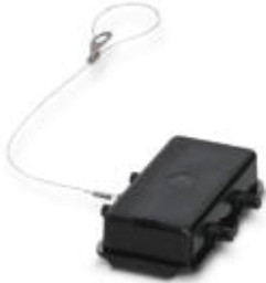
HEAVYCON protective cover, B10, for HC-EVO-B10... supporting base element, for double locking latch, with retaining cord with combination eyelet, IP54

Please be informed that the data shown in this PDF Document is generated from our Online Catalog. Please find the complete data in the user's documentation. Our General Terms of Use for Downloads are valid ( http://phoenixcontact.com/download )