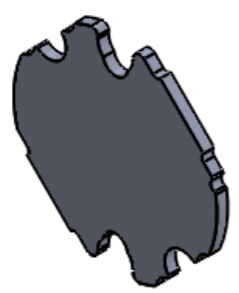
3D View Scale:- 2:1