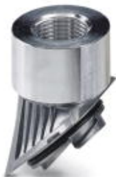
Adapter, aluminum, for EVO housing, NPT-3/4" thread

Please be informed that the data shown in this PDF Document is generated from our Online Catalog. Please find the complete data in the user's documentation. Our General Terms of Use for Downloads are valid ( http://phoenixcontact.com/download )