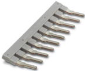
Insertion bridge, pitch: 10 mm, number of positions: 10, color: gray

Please be informed that the data shown in this PDF Document is generated from our Online Catalog. Please find the complete data in the user's documentation. Our General Terms of Use for Downloads are valid ( http://phoenixcontact.com/download )